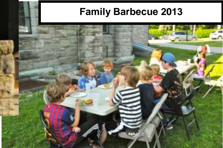
Family BBQ