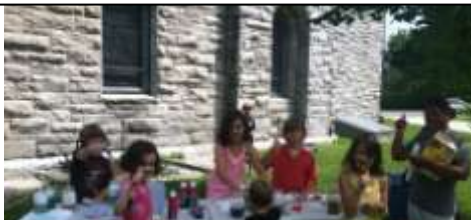
We experimented with clouds, had popsicles for snacks and created beautiful coffee filter art.

Day 2 - God created an expanse to separate the waters and called it "sky."