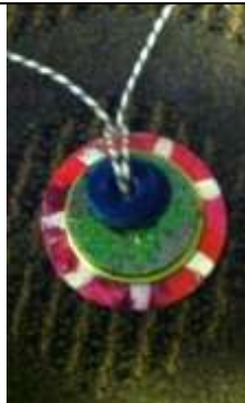
We created sun, moon and stars jewelry using washers and nail polish.

Day 4 - God created the sun, moon, and the stars to give light to the earth and to govern and separate the day and the night.