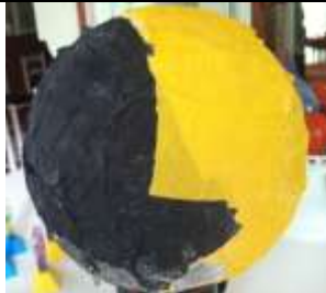
We created paper mache balls representing the darkness and the light.

Day 1 - God created light and separated the light from the darkness, calling light "day" and darkness "night."